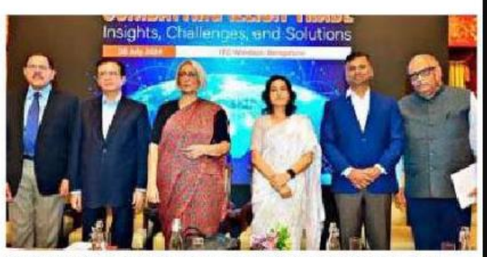
Panellists at a seminar on 'Combating illicit trade', in Bengaluru on Tuesday.

"Our commitment to preserving traditional crafts and ensuring access to genuine, quality goods is